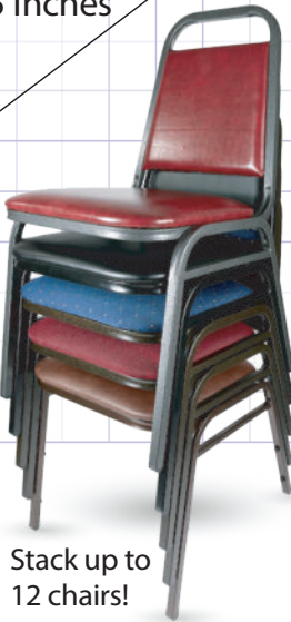
Stack up to 12 chairs!

A Critical Difference Critical joints are secured by welding them -- for maximum strength and stability! No screws!